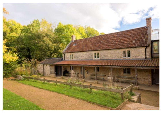
Farmhouse Bedroom Exterior