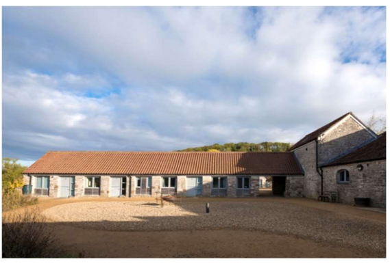
Studio Bedroom Exterior